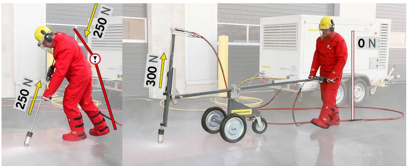
Cleaning and removal operations on the floor

Reaction force free working with JETBOY device. The reaction force (N) is taken by the water tool fitting device.