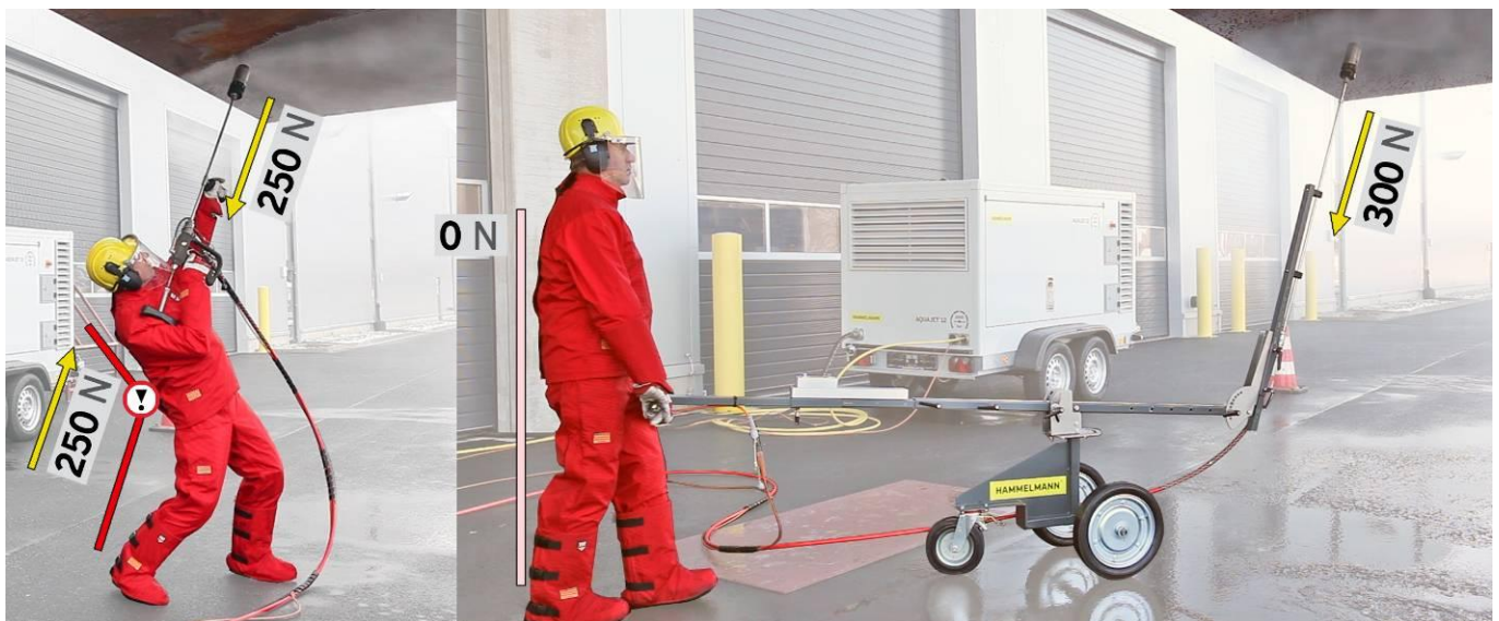
Manual blasting gun work

Reaction force free working with JETBOY device. The reaction force (N) is taken by the water tool fitting device.