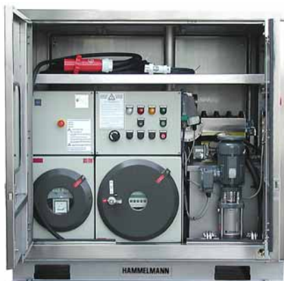
Ex-proof Zone 1 control cabinet