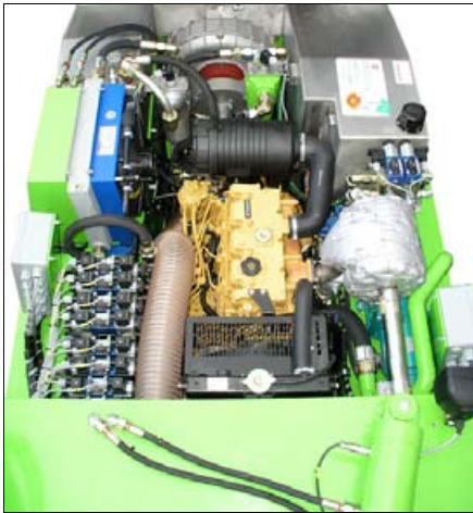
The hydraulic system uses biodegradable oil.