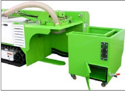
Filter/disposal module for waste and waste water.