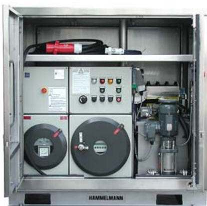
Ex-proof Zone 1 control cabinet